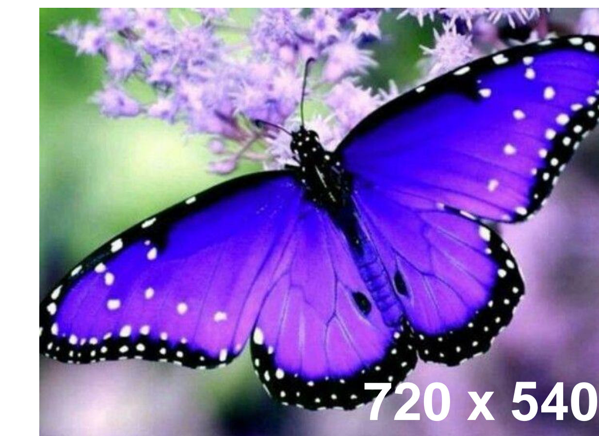
Image 1. Label all pictures with key information on relevance to the poster